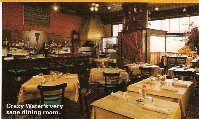
Crazy Water's very sane dining room.